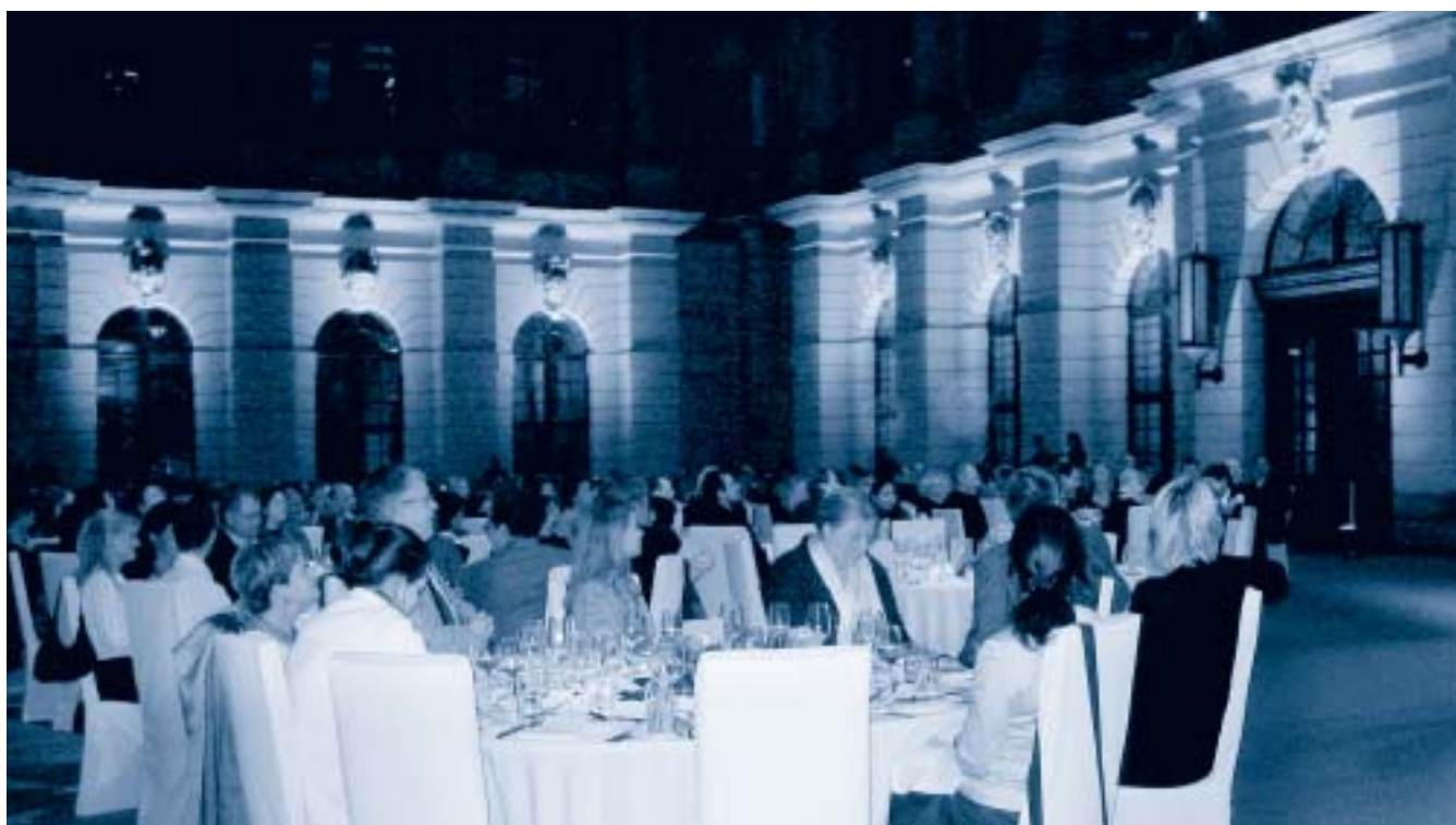
The Congress Dinner was held at the Schlüterhof, in the Berliner Castle, the oldest and biggest antique courtyard in Berlin